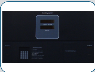
Integrated ERA box (black optional)

> Updated Image, while retaining classic H-frame design - integrated ERA box and one piece lower door provides a larger branding area, a more integrated look and improved access to hydraulics for easier maintenance.